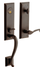
VENETIAN BRONZE DELUXE HANDLESET