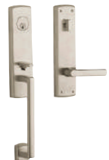
SATIN NICKEL DELUXE HANDLESET